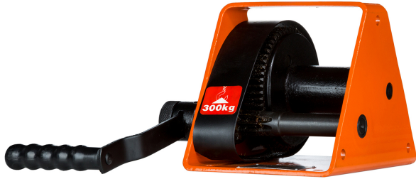
660 lbs. Manual Winch Automatic Brake