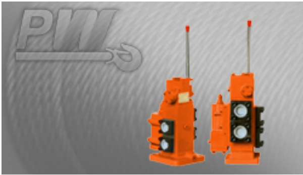
Directional Hydraulic Control Valve PWSH45