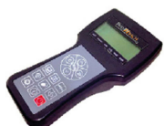
PWHY280 Simple remote control with Display/ Control remoto simple con visor