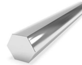
PH17-4 Acero inoxidable martensítico endurecido por precipitación con adiciones de Cu y Nb/Cb. Alta resistencia a la corrosión. Puede ser sumergido en agua por un largo período de tiempo / Precipitation hardening martensitic stainless steel with Cu and Nb/Cb additions. High corrosion resistance. Can be submerged in water for a long period of time