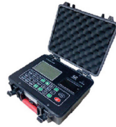
PWHY680 Control remoto con impresora y visor / Remote control with printer and display