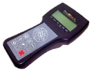
PWHY280 Control remoto simple con visor / Simple remote control with Display