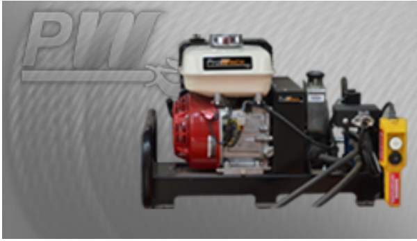
Hydraulic Power Pack Honda Gas