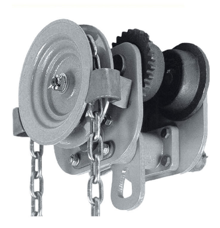
Referential Images Specifications may change without notice