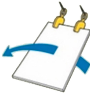
Turning-over of steel plates / Cambio de cara de láminas de acero