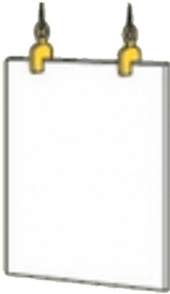
Vertical lifting of steel plates / Izaje vertical de láminas de acero